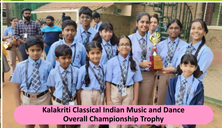
Kalakriti Classical Indian Music and Dance Overall Championship Trophy