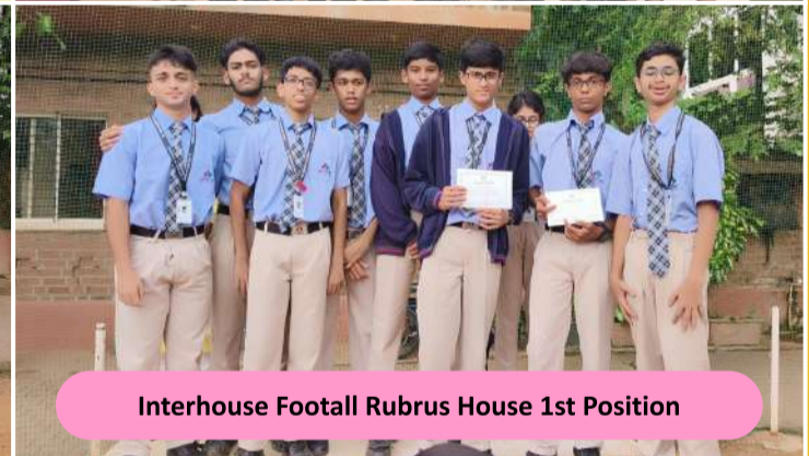
Interhouse Football Rubrus House 1st Position