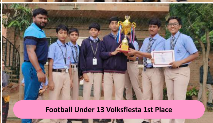
Football Under 13 Volksfiesta 1st Place