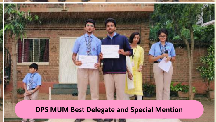
DPS MUM Best Delegate and Special Mention