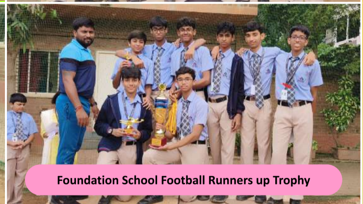
Foundation School Football Runners up Trophy