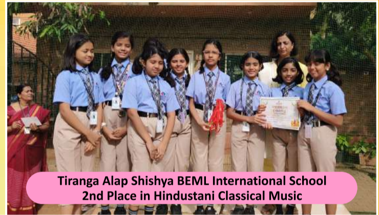
Tiranga Alap Shishya BEML International School 2nd Place in Hindustani Classical Music