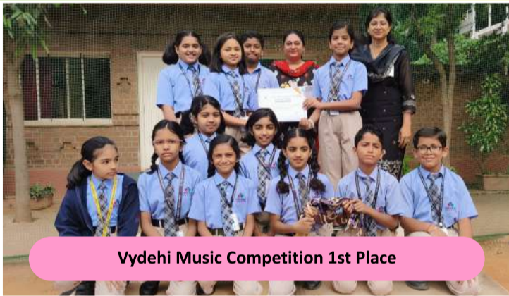
Vydehi Music Competition 1st Place