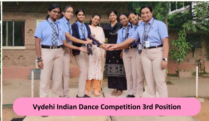
Vydehi Indian Dance Competition 3rd Position