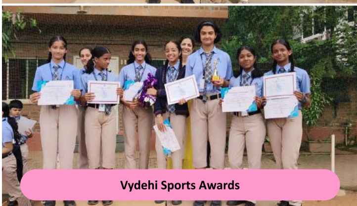
Vydehi Sports Awards